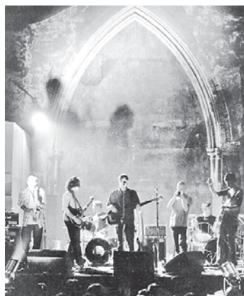
INSTRUMENTAL ENSEMBLE Canadian jazz-influenced band Do Make Say Think's part-jazz, part-experimental rock is rather interesting

Talking about jazz, I stumbled upon a Canadian jazz-influenced band, curiously called Do Make Say Think. An instrumental ensemble, Do Make Say Think uses electronic effects, guitars, saxophones and other wind instruments to create part-jazz, part-experimental rock that can be rather interesting. I believe they have six or seven full-length albums out but I sampled their EP called The Whole Story of Glory . YouTube has a few videos of tracks from their live sessions that can be checked out, particularly one called Reitschule .