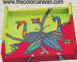
▲ hand painted trays

Contact: swati.seth@thecolorcaravan.com, www.thecolorcaravan.com