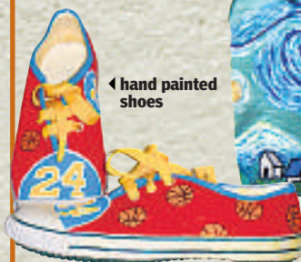
◀ hand painted shoes

Contact: www.crazypalette.in, www.facebook.com/crazypalette