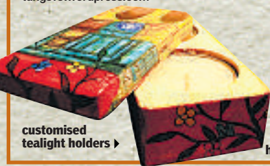
customised tealight holders ▶

Contact: donivdesignco@gmail.com, tungs10.wordpress.com