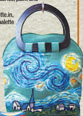
▲ embroidered hand-bags