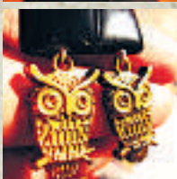
▲ earrings from ancient coins