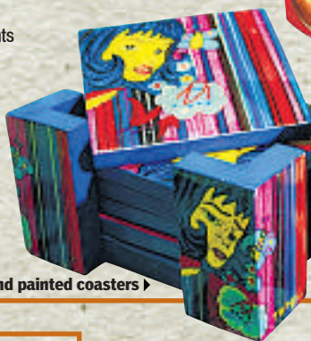
hand painted coasters ▶