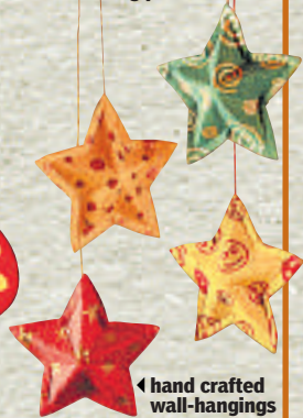
◀ hand crafted wall-hangings