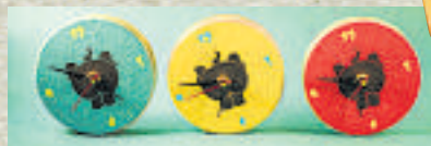
◀ recycled paper clocks