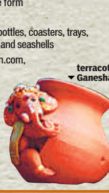
terracotta ▼ Ganesha pots