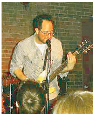
SOUND OF MUSIC Swedish singer-songwriter of Argentine descent José González (top) and Hold Steady lead vocalist Craig Finn who also fronted the band Lifter Puller in the early 1990s (above)

(To stream or download the music mentioned in this column, go to www.hindustantimes.com . And send feedback to downloadctrl@gmail.com )