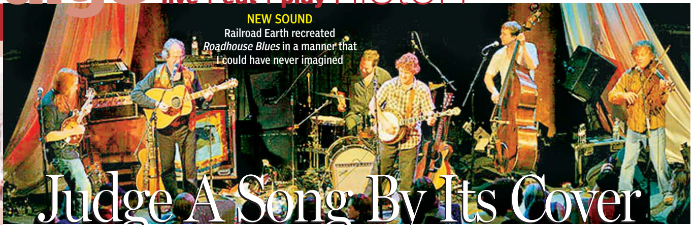
NEW SOUND Railroad Earth recreated Roadhouse Blues in a manner that I could have never imagined