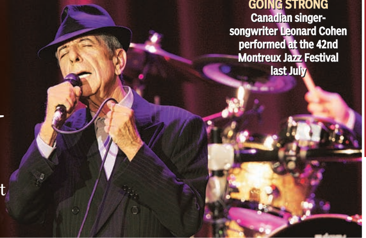
GOING STRONG Canadian singer-songwriter Leonard Cohen performed at the 42nd Montreux Jazz Festival last July

If you like Leonard Cohen, you are likely a lyrics person and must get his Live In London album